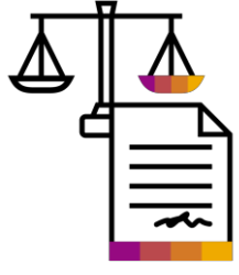
CRIMINAL CHECK & CONSENT FORM