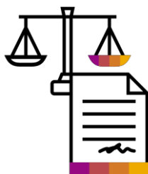
CRIMINAL CHECK & CONSENT FORM